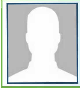
This could be you! For more information on the AWWOA Board of Directors elections visit: www.awwoa.ca/about-us/our-executive