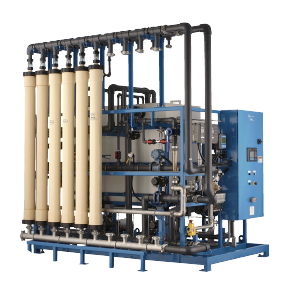
Pall Microfiltration and Reverse Osmosis Membrane Treatment