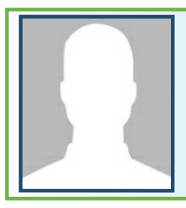
This could be you! For more information on the AWWOA Board of Directors elections visit: www.awwoa.ca/about-us/our-executive