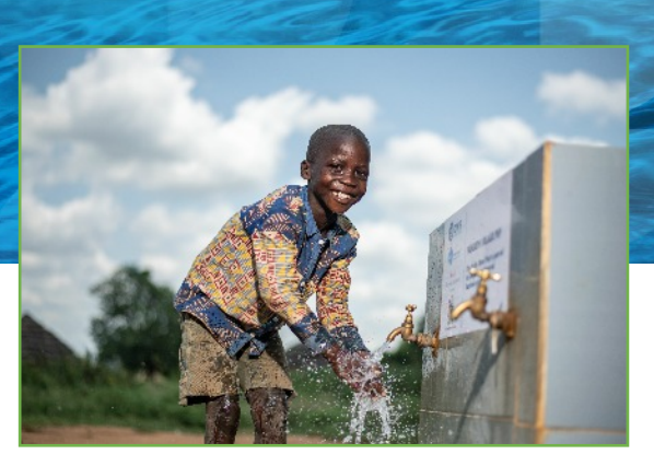
The Water School Project

As we reflect on 2022 and look forward to new beginnings in 2023, I would like to thank the AWWOA members and our Suppliers for their continued support for the Water School.